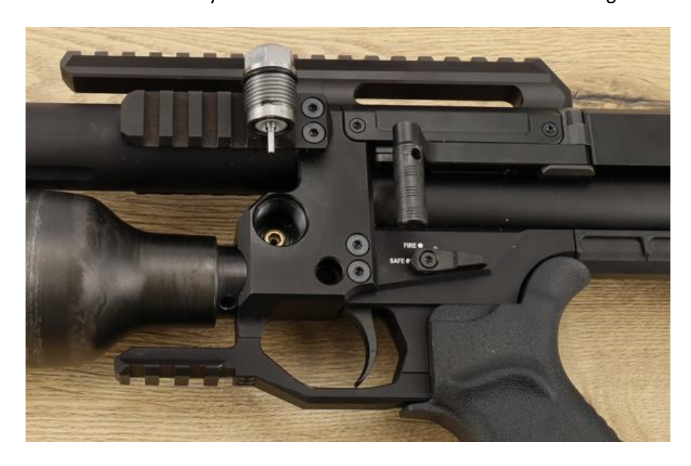
Using a 4mm hex key unscrew this brass plug. You'll find an o-ring underneath it. This oring also needs to be removed

Once this is removed you'll see a brass screw at the bottom of the regulator orifice