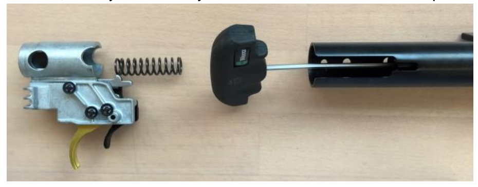
After this you can unscrew the valvehouse

Unscrew the triggergroup and after you have removed it you see an allen bolt inside the hammer, when you loosen it you can take out the hammer latch pin.